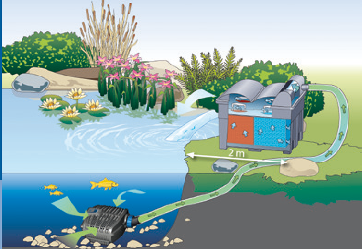
Schematic diagram: BioSmart UVC 16000 in combination with filter and watercourse pump AquaMax Eco Classic